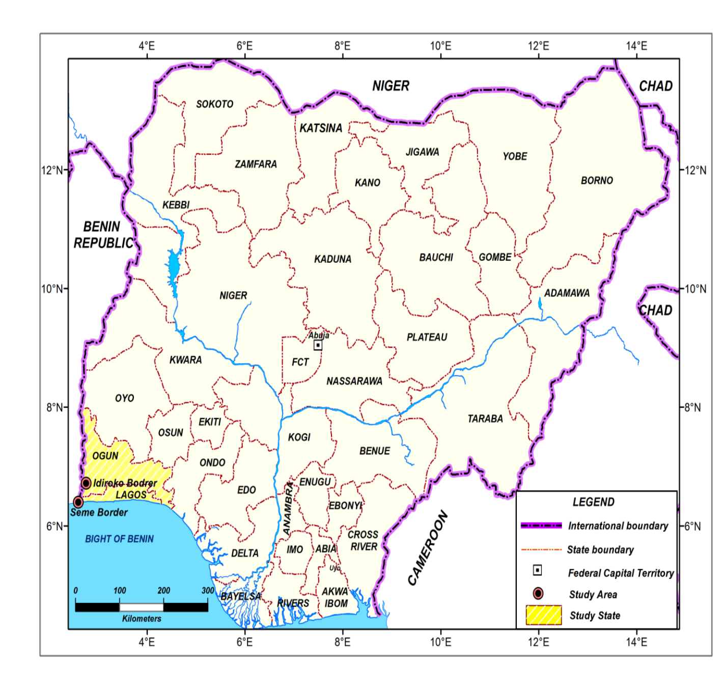
Figure 3: Map of Nigeria showing the study locations