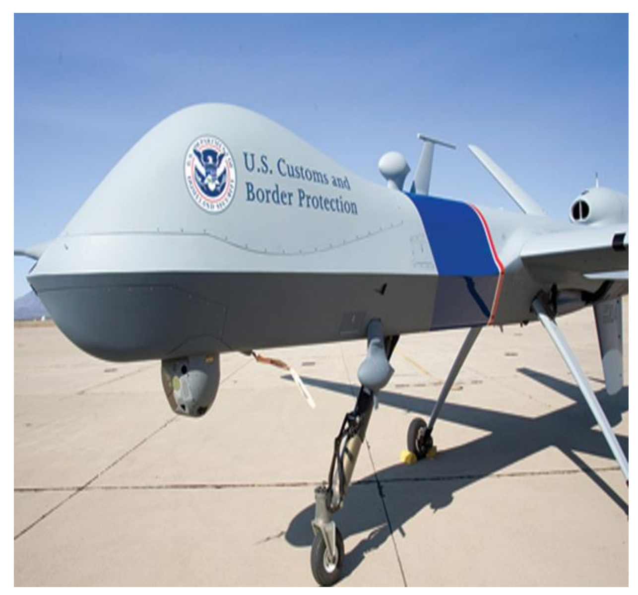
Figure 4: Tactical unmanned aerial surveillance drone