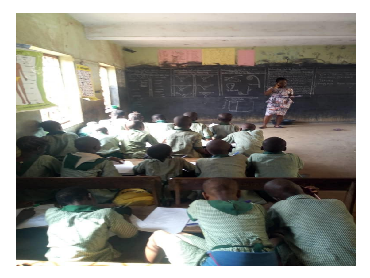
APPENDIX IX PHOTOGRAPHS FROM DATA COLLECTION SESSIONS