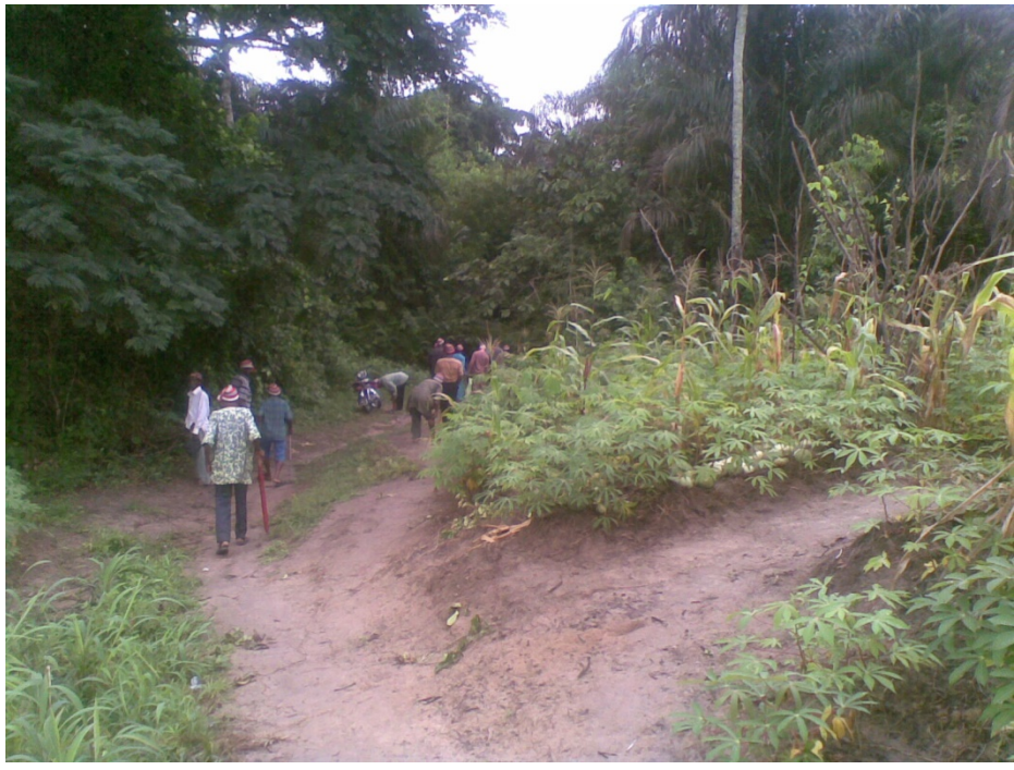
Figure 16. The road leading to the land in dispute