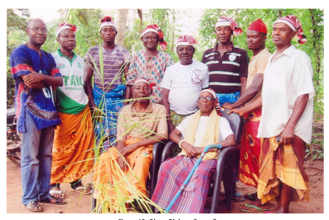
Figure 13. Okwu Olokoro Focus Group