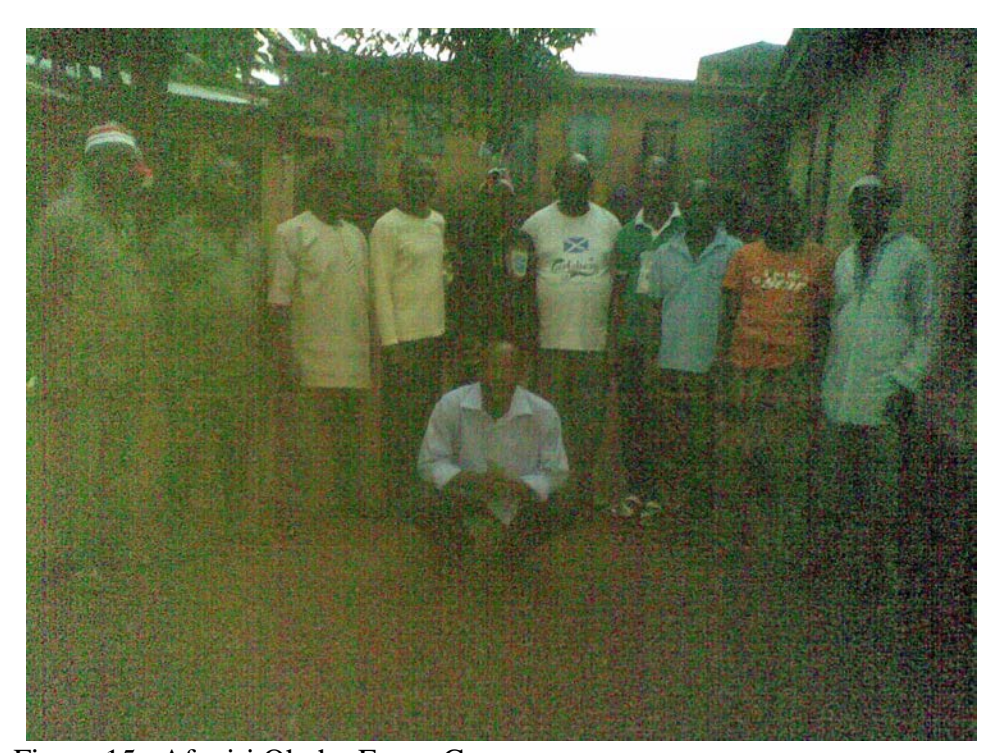
Figure 15. Afugiri Ohuhu Focus Group