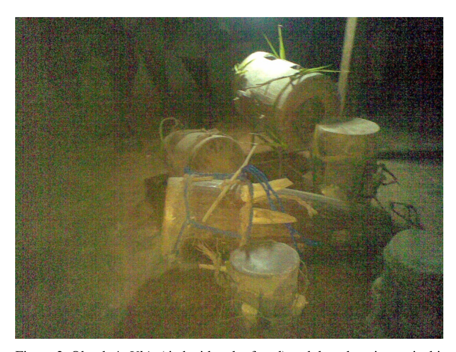
Figure 2. Okonko's Uhie (tied with palm frond) and the other six musical instruments