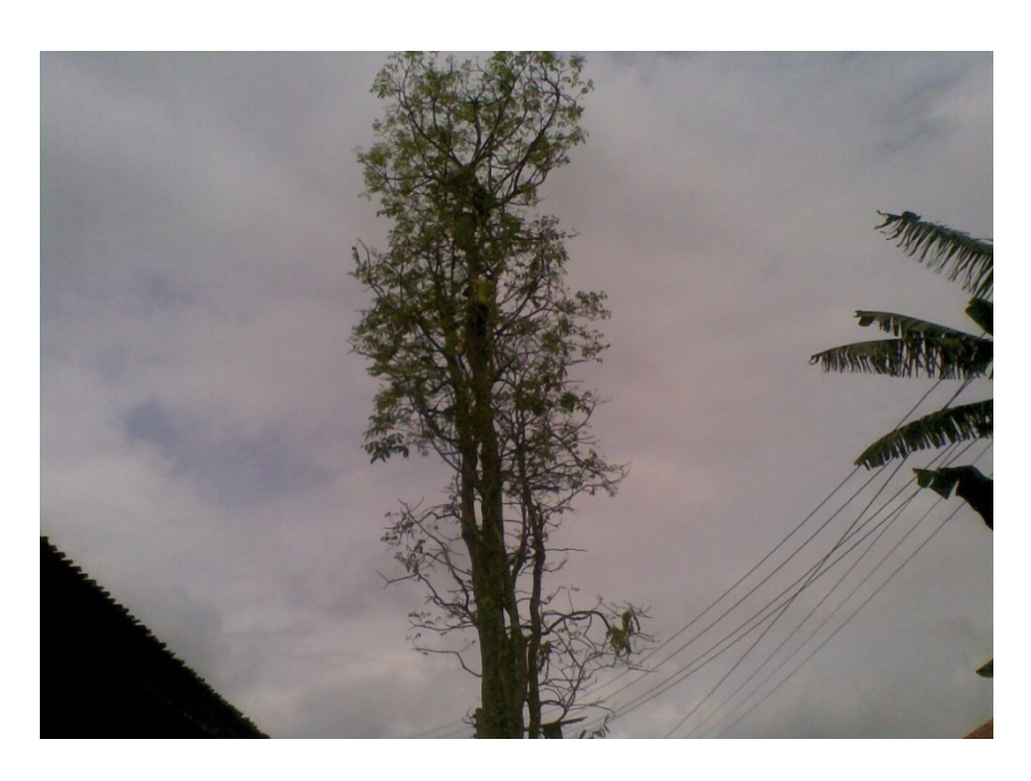
Figure 3. The Uha tree symbolising longevity