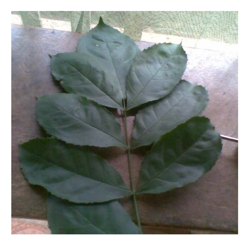
Figure 4. Ugirisi (or Okoronko) symbolising sacredness and protection; always found in shrines and borders between lands