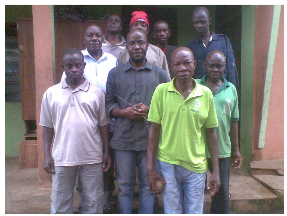
Figure 14. Ipupe Ubakala Focus Group