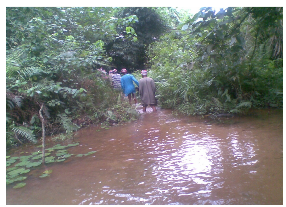
Figure 17. The river from which the farmland derives its name