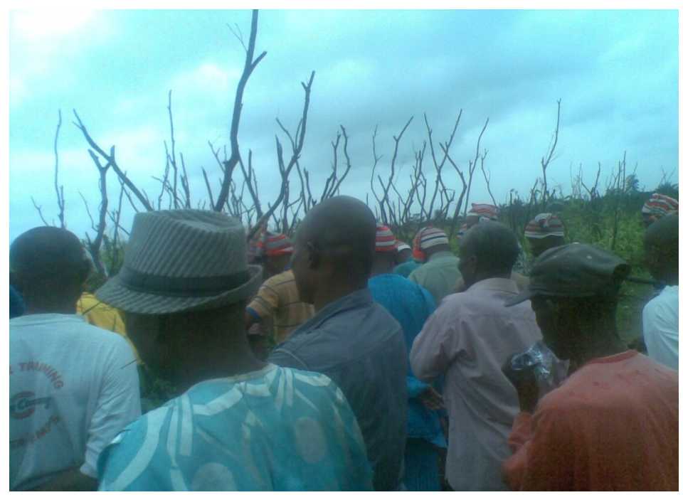
Figure 18. Land inspection in progress