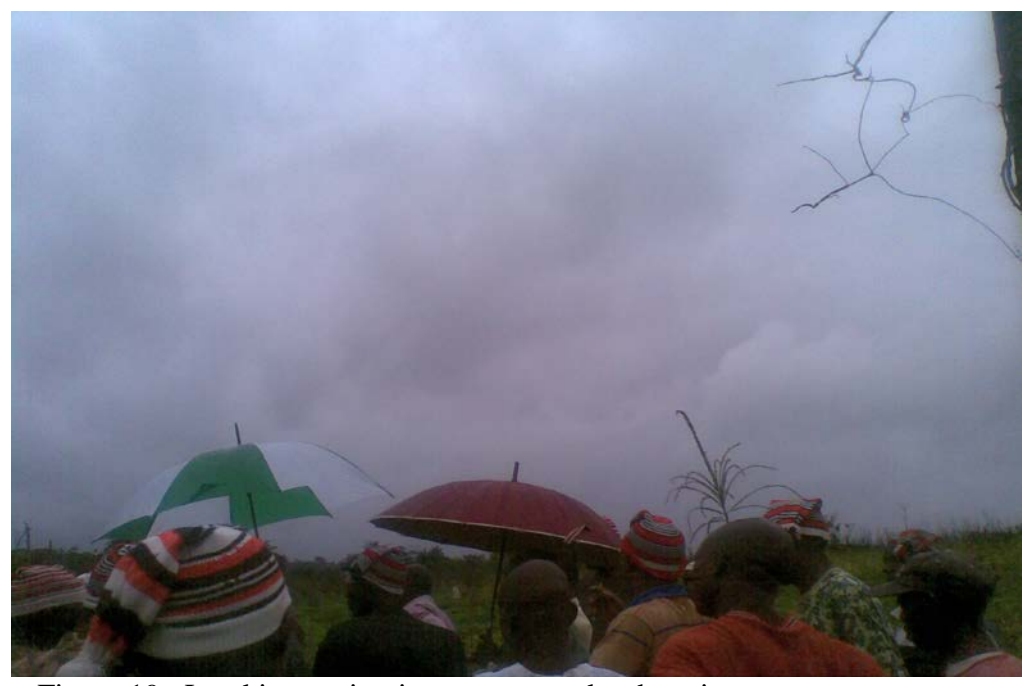
Figure 19. Land inspection in progress under the rain