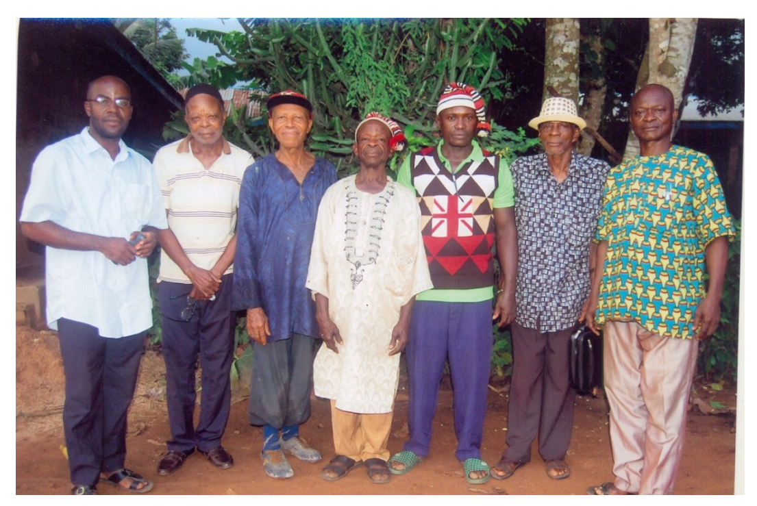
Figure 12. Ndume Ibeku Focus Group