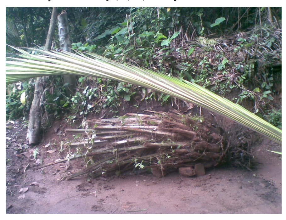
*Figure 1. Omu Okonko symbolising peace and authority