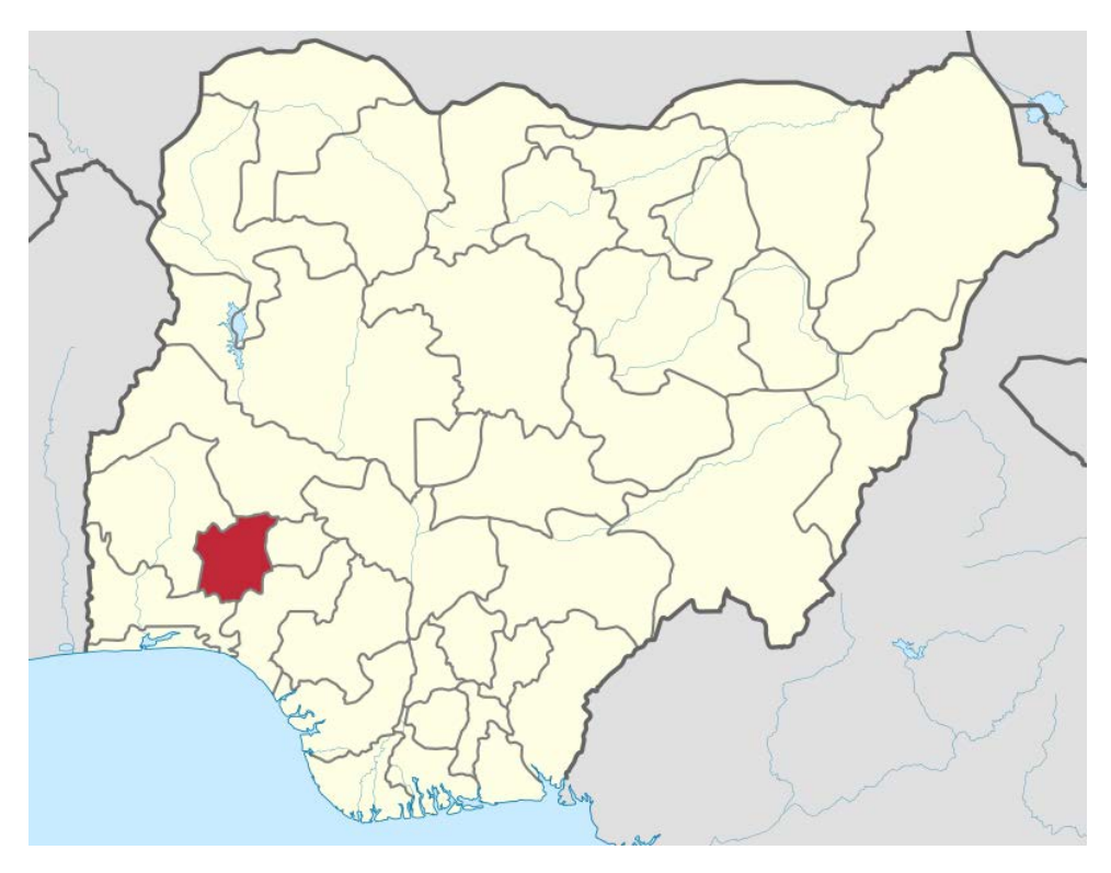
Figure 2: Map Showing the Study Area

Agriculture is the main stay and the predominant occupation of most of the populace alongside with other allied vocations trading, crafts, agro- processing etc. Major food crops grown zone include cassava, yam and maize while cash crops include cocoa, cashew, and oil palm.